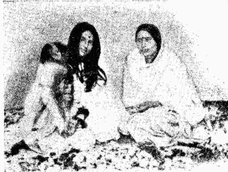
In the photo the form of a child had appeared overlaying the Kumari